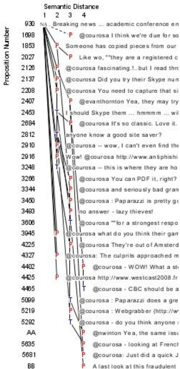
Figure 3. VisualDTA diagram of a conversation with 10 participants

that several simultaneous sub-threads developed. Moreover, while some gradual, diagonal drift is evident, the overall shape of the VisualDTA diagram resembles a set of reactions to an initial prompt more than a collaboratively negotiated, gradually developing conversation. However, even though it is less coherent than the conversation in Figure 2, this group conversation still accomplishes the exchange of information and the collaborative development of ideas.