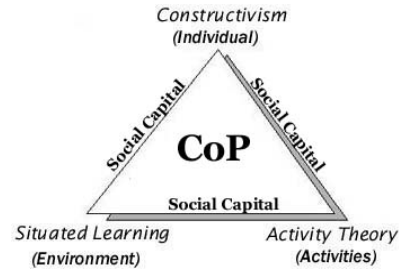
Figure 1. Theoretical model

To help build a sustainable online community of learners we rely on three theories of how individuals receive and process knowledge in CoPs and online learning environments (OLEs).