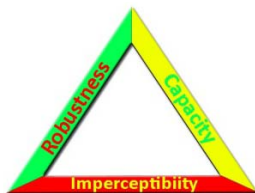
Figure 1. Measurement triangle of steganography

As shown in Figure 1, important steganography measurements are as follow: