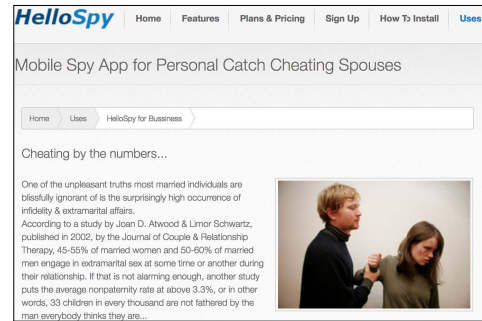
Fig. 1: Screenshot of the HelloSpy website promoting intimate partner violence [35].

store apps). While this labeling may be appropriate for other contexts, for IPV victims these tools are far too conservative. The tools do better detecting off-store spyware, but still fail to label some dangerous apps.