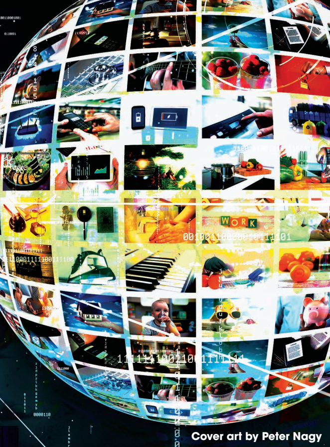
Cover art by Peter Nagy